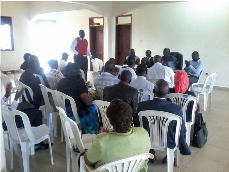
Induction Meeting at Nasana Municipal Council