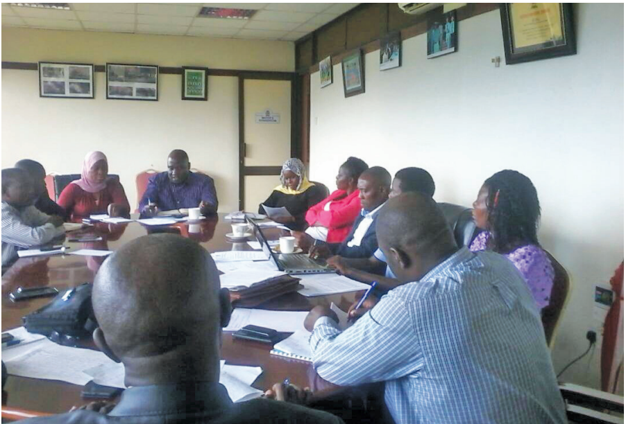
Meeting of LVRLAC leadership at Entebbe Mayors' Board room