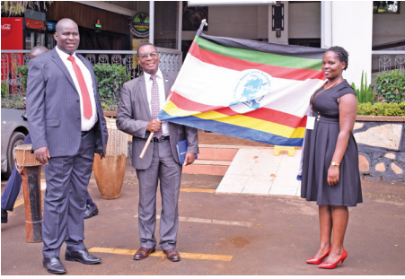
Chairperson LVRLAC Kenya Chapter receiving a flag to host LVRLAC AGA for 2019 Kisumu Kenya

Lake Victoria Region Local Authorities Cooperation (LVRLAC) Annual General Assembly (AGA) is a week-long event, dictated by LVRLAC constitution, organized annually on a chapter/country rotational basis. Organizing LVRLAC regional AGA, is a mandate of the regional secretariat in conjunction with the host Chapter and host local Authority. This year's AGA will be held from 10th – 14th June/ 2019 at Tom Mboya labour college in Kisumu City – Kenya.