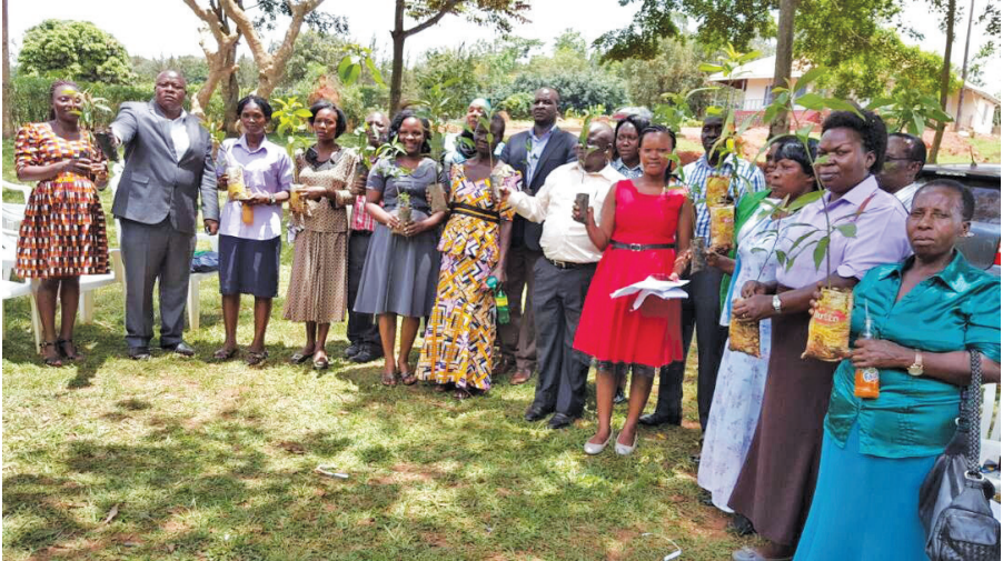
Giving out tree seedlings to Kyengera Town Coucil community