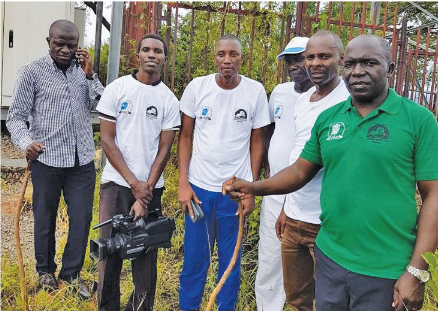
After Bamboo Planting at River Aturutuku at Tororo Municipal Council before LVRLAC Uganda Chapter AGA 2018