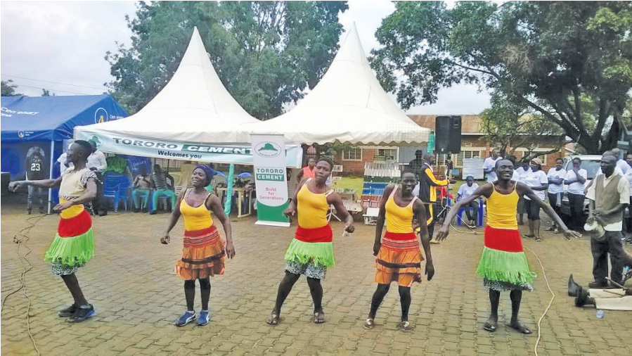
Entertainment at Tororo Municipal Council before LVRLAC Uganda Chapter AGA 2018