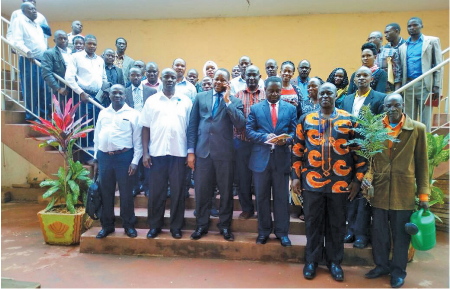
New leadership Induction meeting at Masaka Municipal Hall 2018