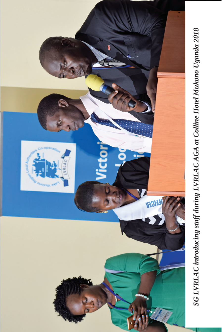
SG LVRLAC introducing staff during LVRLAC AGA at Colline Hotel Mukono Uganda 2018